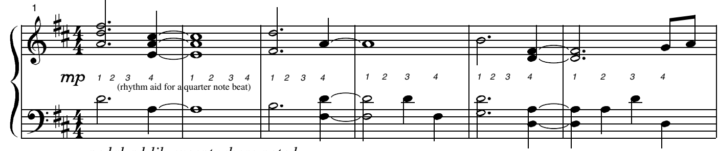
pedal ad-lib except where noted