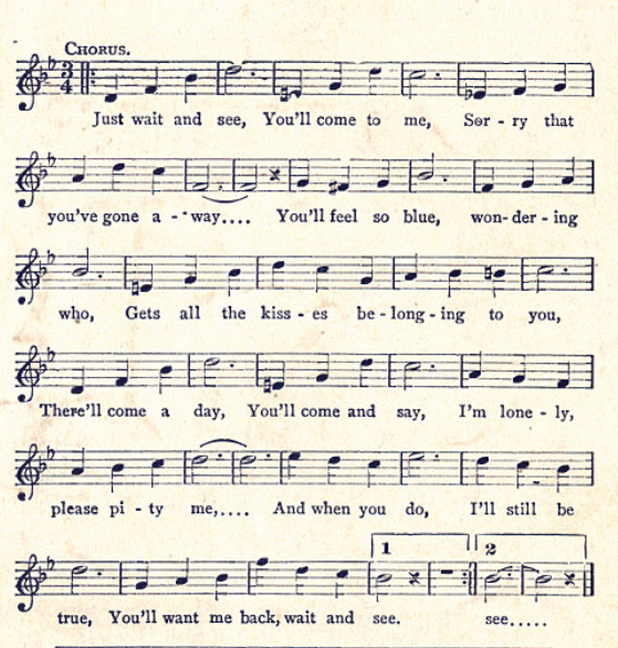
Copyright, MCMXIX, by Jos. W. Stern & Co., New York. British Copyright Secured.